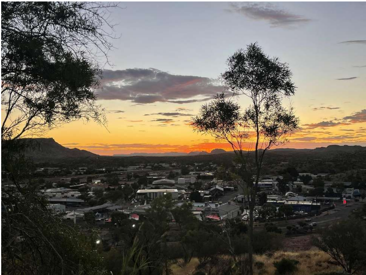
Sunset from ANZAC Hill, Mparntwe (Alice Springs)

IAHA remained engaged with other processes occurring, noting many at the Commonwealth level were delayed either due to reprioritisation in the response to the COVID-19 pandemic or the Commonwealth government caretaker period, with several to recommence in late 2022. IAHA's voice continues to be sought by a range of stakeholders, particularly in areas of key reform.