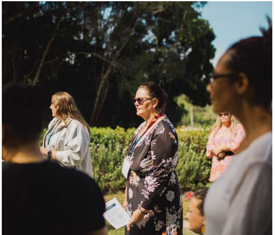
Leadership participants gather outdoor for an activity.