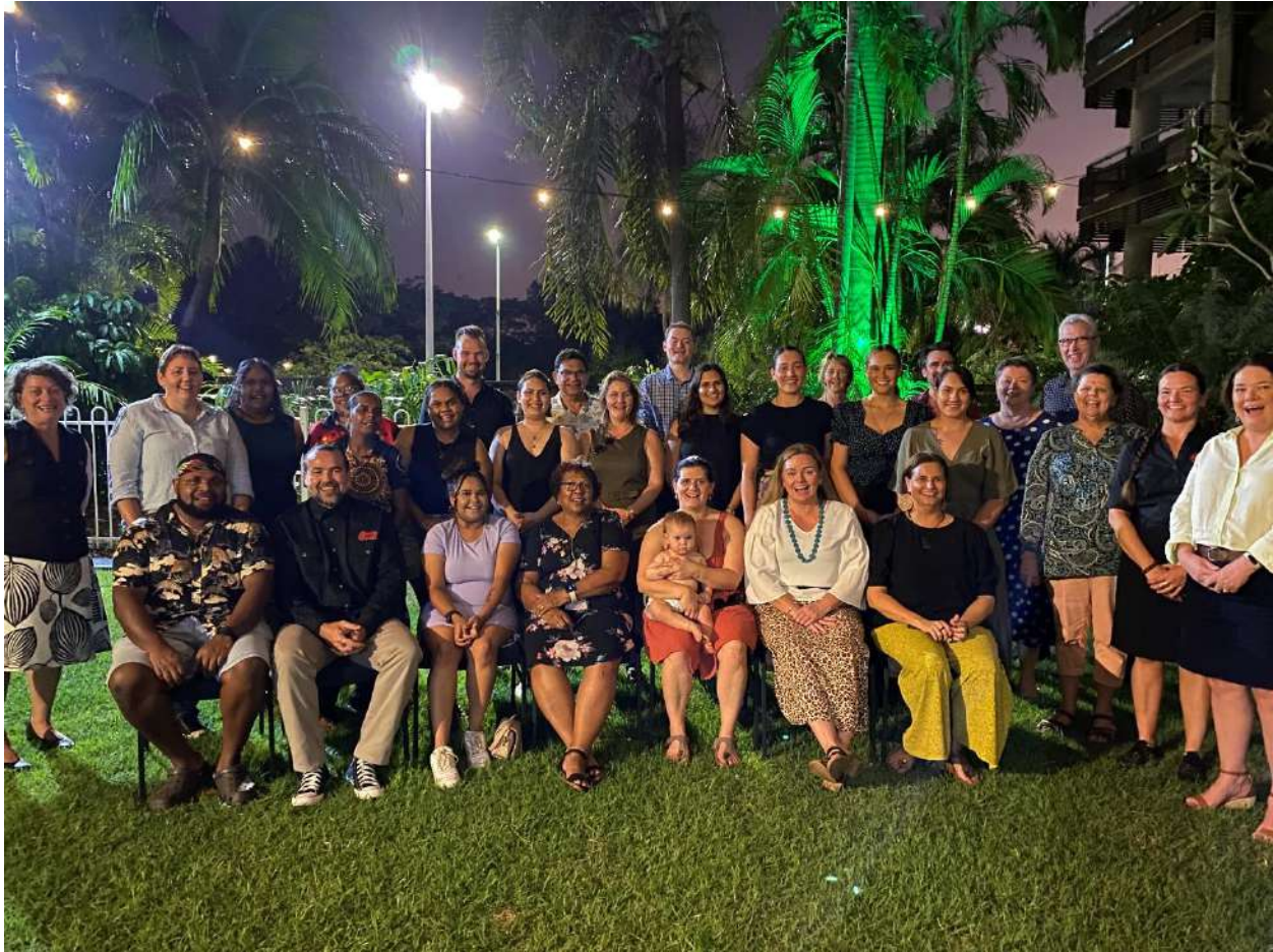
IAHA NT Workforce Development stakeholder event on Larrakia Country