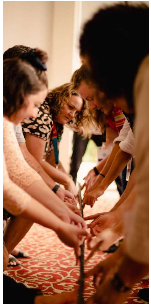
Participants at the Leadership Program working together in a group activity.

Participants in the IAHA Leadership Program are expected to complete elements of the program over a 9-month period, designed to reinforce their knowledge and transfer learnings and experiences into practice. The program is completed through five stages: