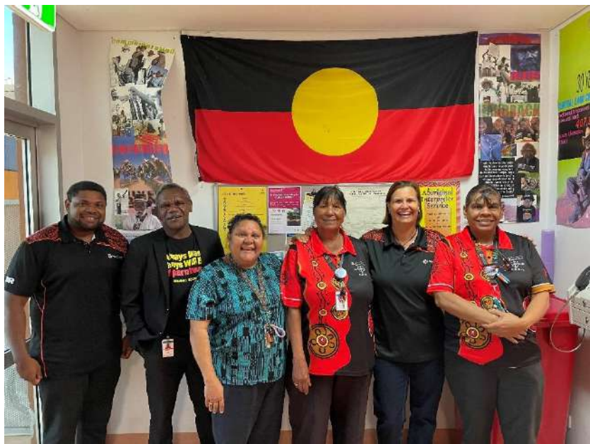
The High School to Deadly Career Program visit the Aboriginal Liaison Officer Team at Alice Springs Hospital