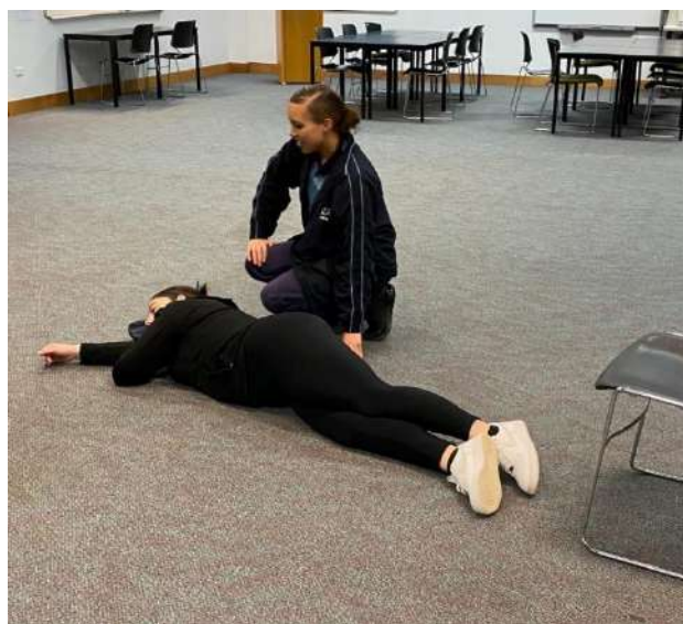
Academy students enacting a fallen patient being assisted by an allied health assistant.

Given the growing interest and positive feedback received to date, IAHA is committed to working closely with the Local Health Districts in this region to continue investing in this program. IAHA is under negotiation with another Sydney-based Local Health District interested in developing another Academy site in the Sydney area to support education, workforce development and health priorities.