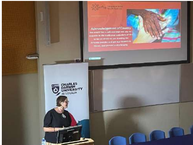
IAHA Executive Director, Workforce Development presenting at the CDU Symposium.

To further strengthen the partnership and joint commitment, IAHA delivered a presentation on ‘ Better Health Futures, Building a Remote and Rural Health Workforce in the NT ’ at the CDU Symposium, promoting health education pathways and practical placement opportunities along with other supports available for students.