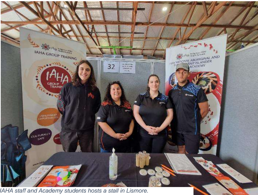
IAHA staff and Academy students hosts a stall in Lismore.