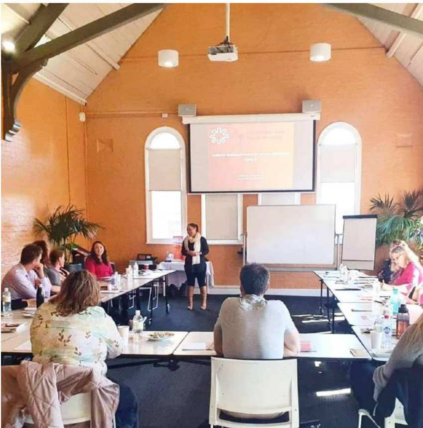
Cultural Responsiveness workshop

Level 3 workshops provide an opportunity for real time facilitated discussions with a focus on actions and accountabilities for cultural safety, delivered as an interactive online session or in person. Development in the 2021-22 financial year has enabled individual and small group learners to have increased access to professional development in cultural safety and responsiveness, in addition to the group-based learning IAHA have more traditionally facilitated, which supports individuals to meet Continuing Professional Development and professional standard requirements.