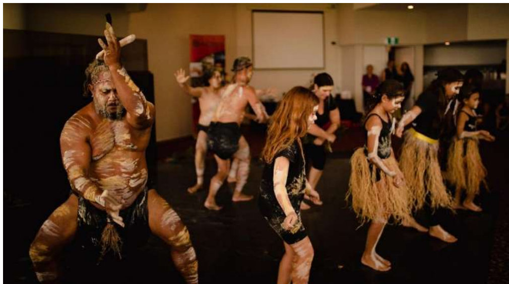
Wajaarr Ngaarlu Dancers perform at the IAHA Leadership Program on Gumbaynggirr Country

Recognising the challenges faced by members during this period, the program continued to provide after-hours opportunities to promote connection among delegates in an interactive and culturally safe environment.