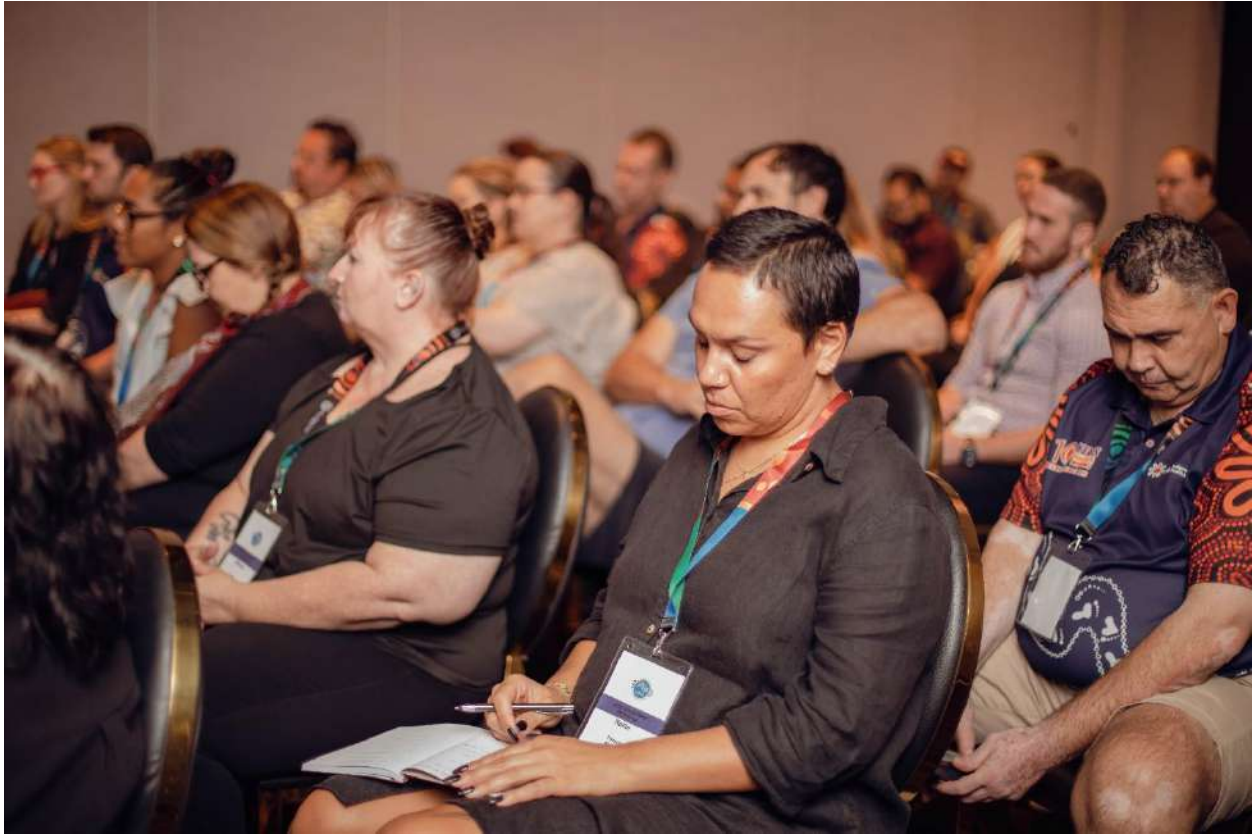
Participants at the 2022 IAHA Leadership Program