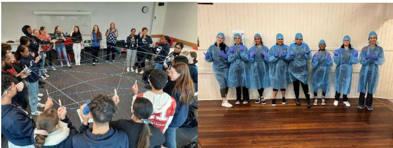
POWA trainees in Southeast Queensland