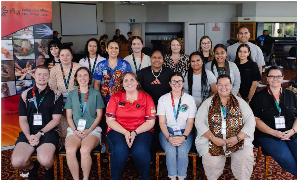
Student cohort of the IAHA Leadership Program on Gumbaynggirr Country in Coffs Harbour

Three scholarships will be available over each of the next few years, with a dedicated opportunity for each of IAHA's full membership categories to take the next step in their leadership.