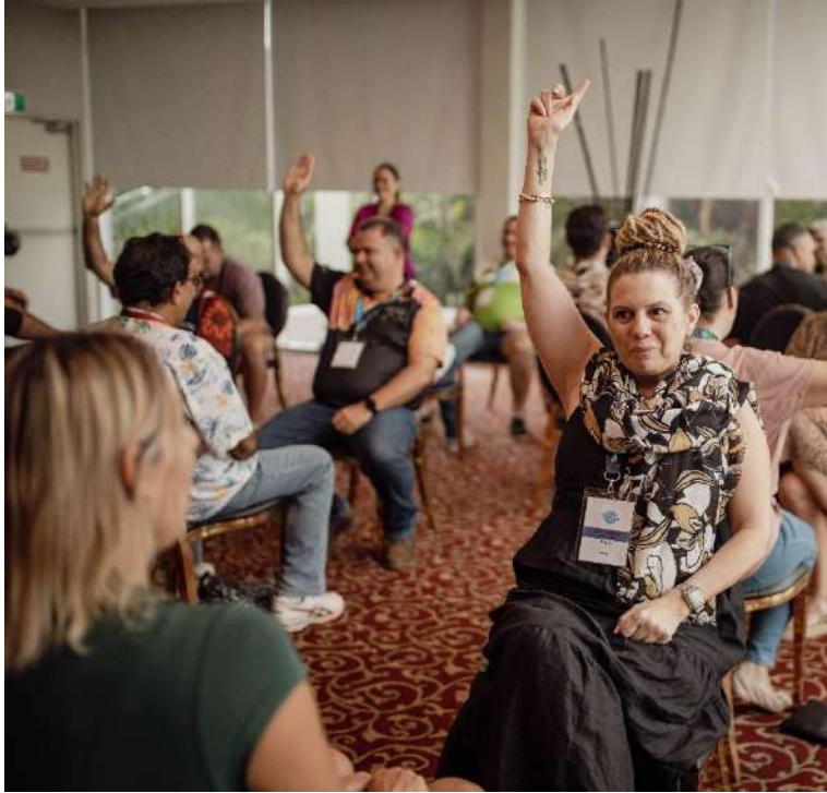
Participants engaging in a workshop at the Leadership Program.