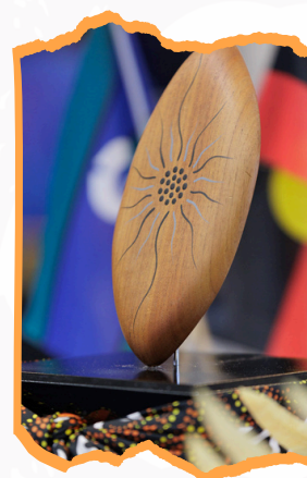
The USLC winners trophy

The IAHA USLC is an opportunity for participants to apply their cultural and clinical skills in a practical manner, develop their leadership skills, network, and get feedback from experts in a culturally safe space to ultimately become a better clinician.